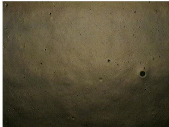
CL-204 Topcoat with PolyFox AT-1126 additive – Spray application – Double pass