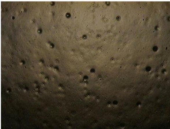
CL-204 Topcoat with competitive additive package – Spray application – Double pass

Comparison of De-aeration and Air Release Results of PolyFox AT-1126 versus a Competitive Additive Package in a Rhoplex CL204 Coating Formulation 3 (above)