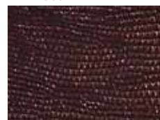
Black Cherry ANT-009