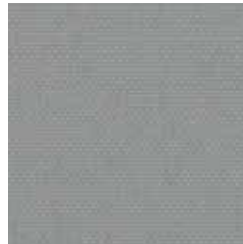
Pearl Gray PTOP1060