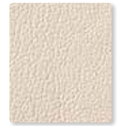
Lamb's Wool 528575