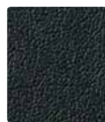
India Ink 528574