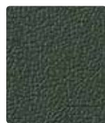
Bay Leaf 528570