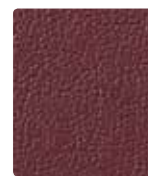
Rum Raisin 528603