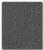
River Rock 528580