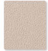
Sand Dune 528583