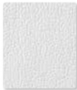
White Tie 528586