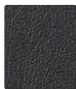
Dark Shadow 528597