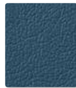
South Pacific 528585