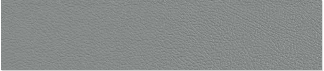
City Grey 532623