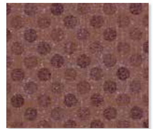
Santa Rosa 514797