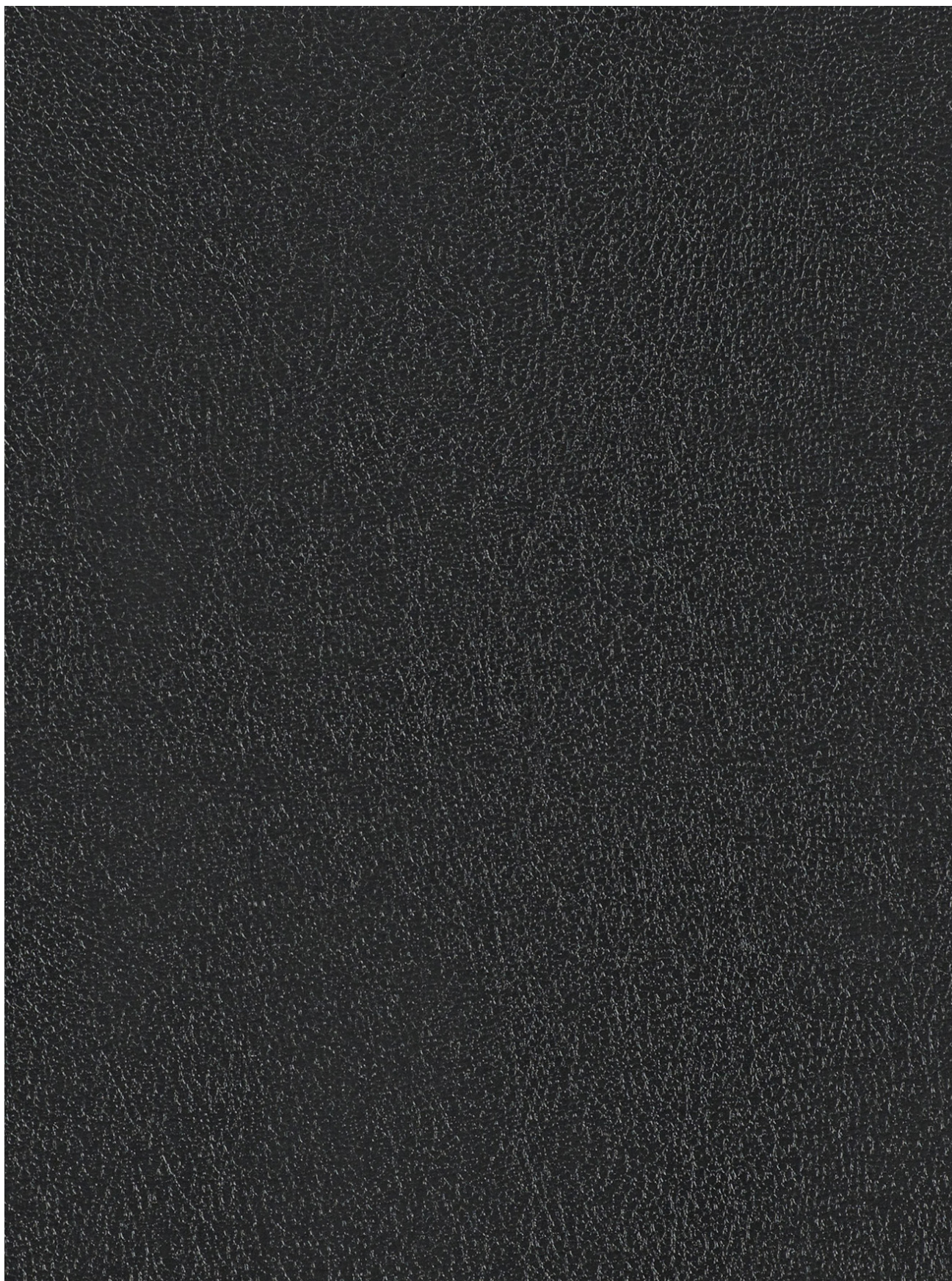
Black Crush 514144