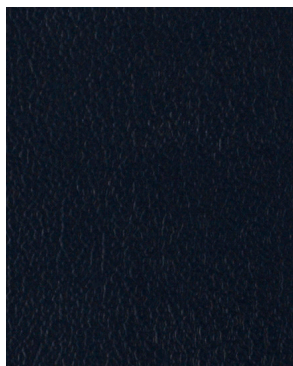
Montana Blue 522272