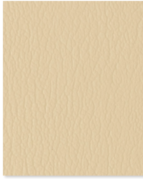
Cappuccino Cream 513699