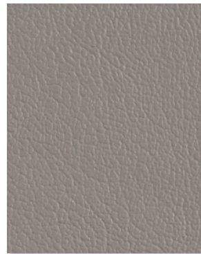
Light Gray 515509