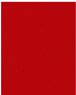
Torch Red 518959