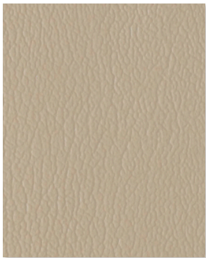
Shale Beige 514201