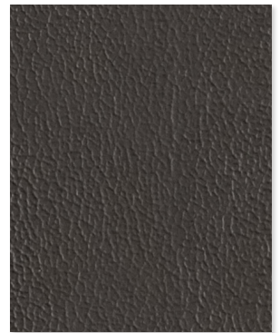
Very Dark Pewter 515507