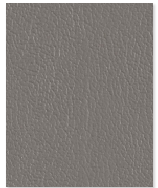
Medium Gray 515508