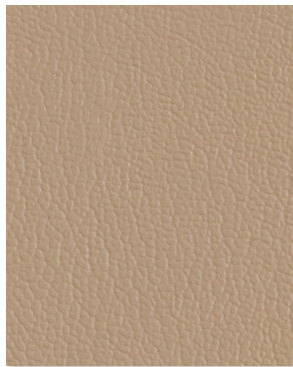
Light Cashmere 515506