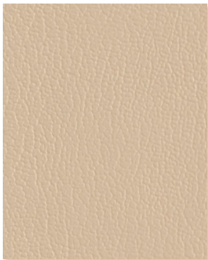
Very Light Cashmere 519035