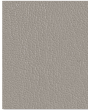
Light Titanium 515505