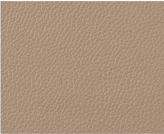
Light Cashmere 515503