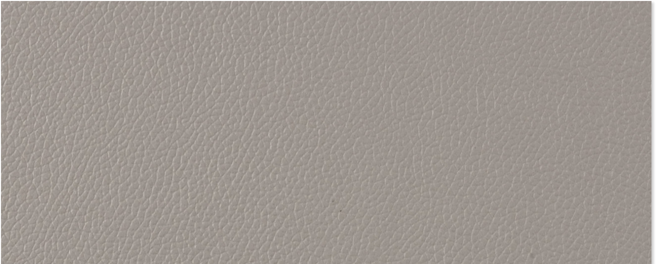
Light Titanium 515502