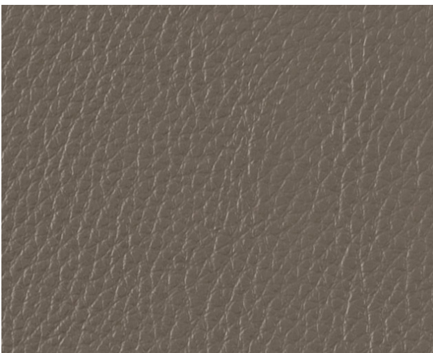
Medium Khaki 515489