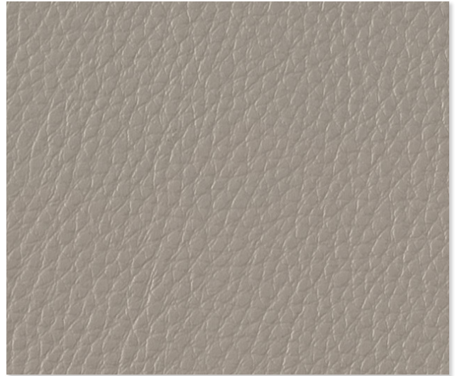
Light Graystone 515487