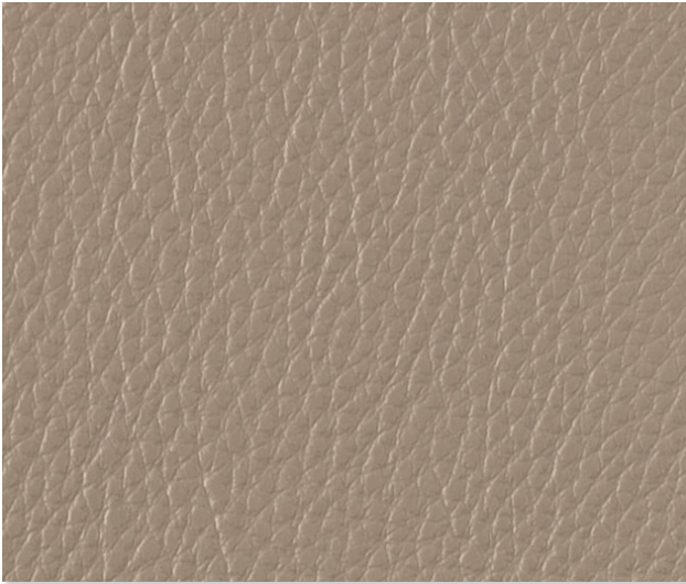
Pastel Pebble 515486