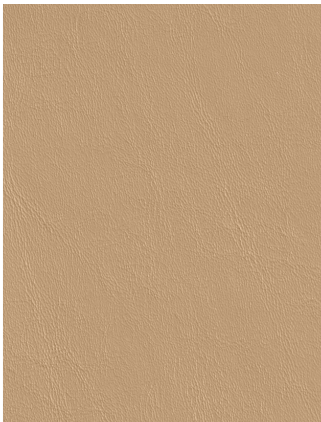
Light Sand 525685