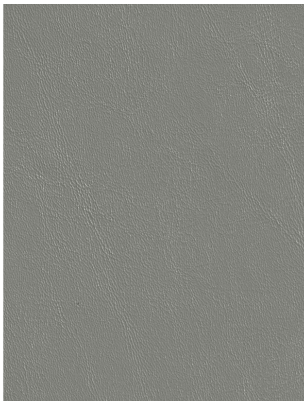
Medium Gray 525686