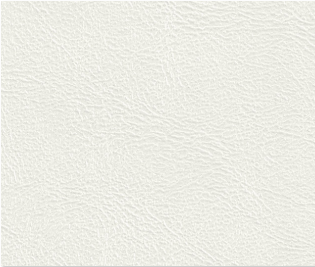
Crystal White 513976